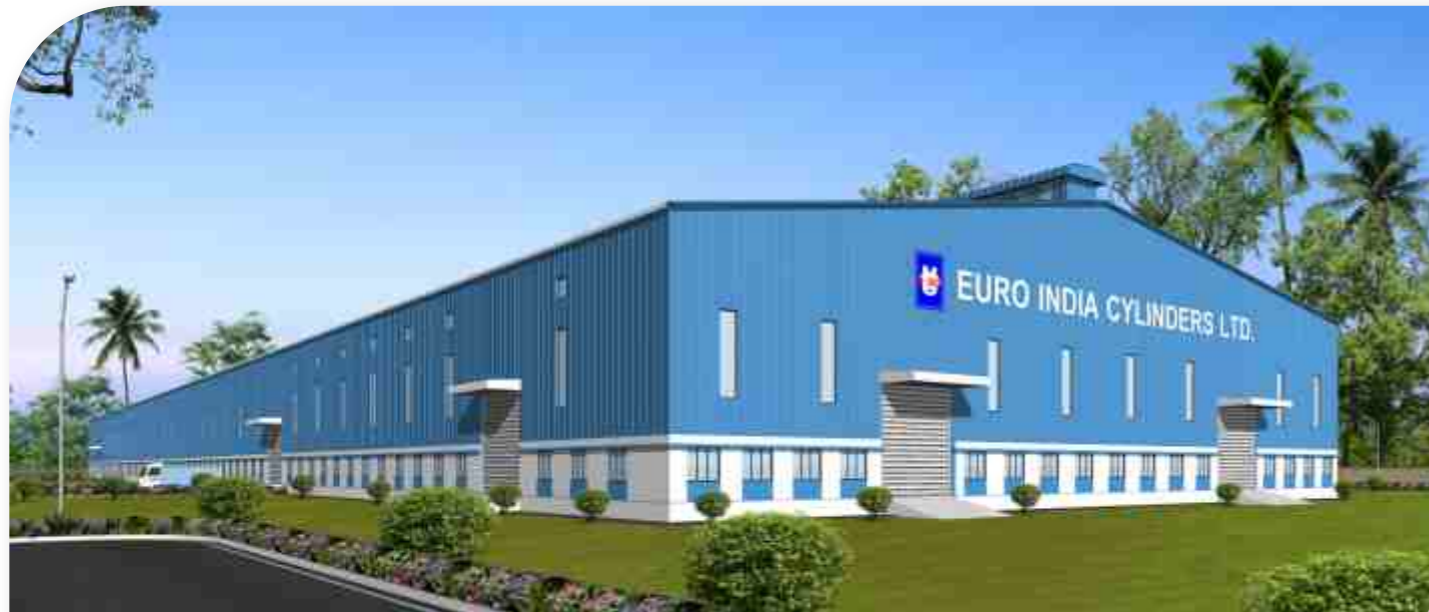
State-of-the-art manufacturing unit located at Kandla Special Economic Zone, Gujarat, India.